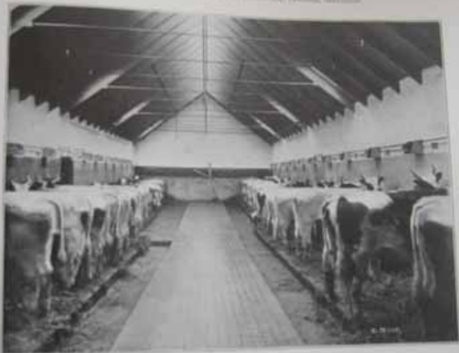
VIEW OF THE BARN AT TIDENHILL FARM

By Charles H. ... A. CHRISTIAN, (LONDON, ENGLAND)